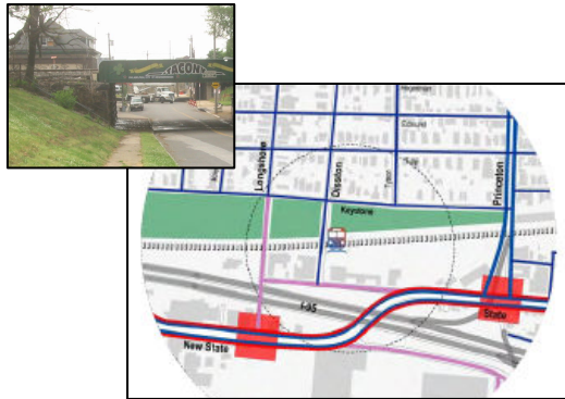
Tacony Station: Street/Intersection Deficiencies

JzTI investigated a wide range of issues as part of the North Delaware Riverfront Rail Stations Urban Design Study (led by Interface Studio), which focused on the regeneration of four SEPTA regional rail stations as neighborhood activity centers. This process entailed determining the appropriate balance between parking and infill development in the direct vicinity of each station.