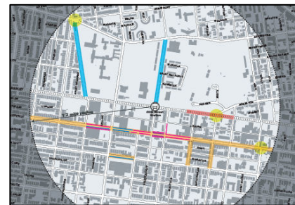
46th St. Station: Street Design Opportunities

The pilot study for the Transit Revitalization Investment District initiative examined similar issues at the Temple Regional Rail Station and the 46th Street Station along the Market-Frankford El. From a transportation perspective, the main goal of this study was to ensure that the transportation infrastructure of the respective areas—including streets and intersections as well as bus stops and rail stations—fully reinforces the redevelopment objectives of the surrounding neighborhoods. (led by Interface Studio).